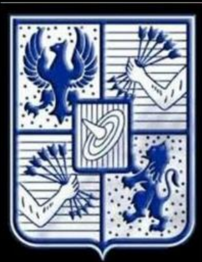
▲ LCF Rothschild Group insignia.